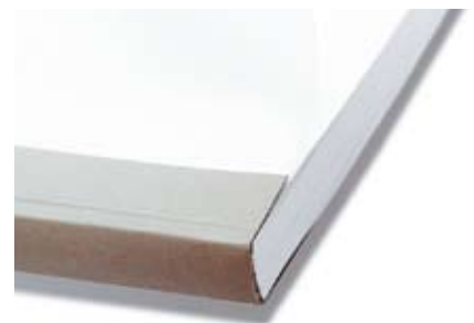
When you use a Bindomatic cover, the paper edges are as even as in a book.

The Classic cover, ensuring your documents stay neat and smart-looking. A smooth structured white paper cover with a crystal clear plastic front. Nothing more, nothing less.