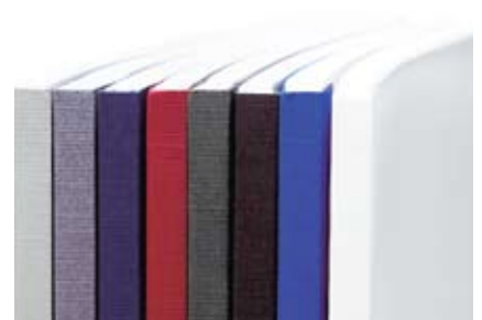
Bindomatic Aquarelle covers are available in grey, graphite, dark blue, burgundy, dark green, black, blue or white.

The colours and paper quality do all the talking for this cover. The texture of the paper resembles linen and the front is made from transparent, frosted/mat plastic. Choose from eight elegant colours: graphite, white, burgundy, black, blue, dark blue, grey or dark green.